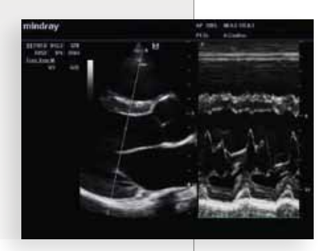
Adult heart, left ventricle