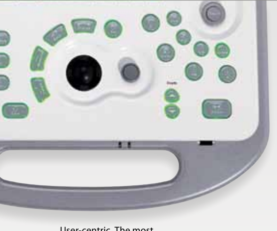
User-centric. The most common commands are easily executed with minimal movement of one hand.