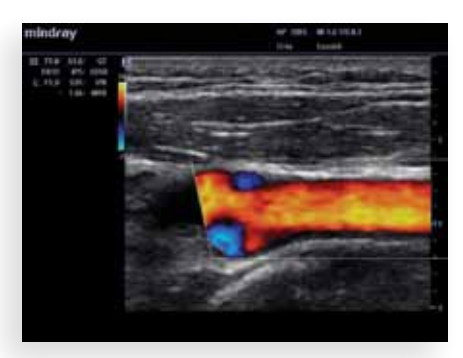
Common carotid artery