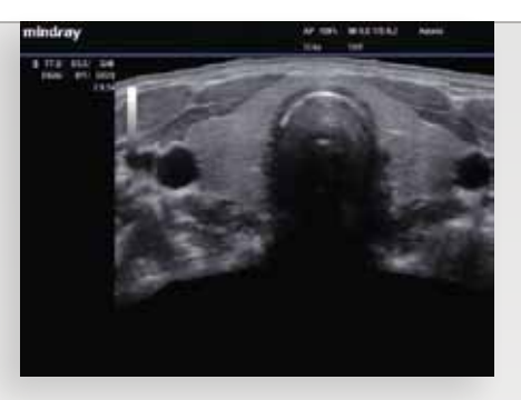
Thyroid, iScape ™ Panoramic imaging