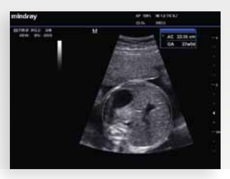
Fetal abdominal circumference