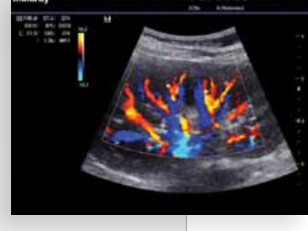
Renal arteries and veins