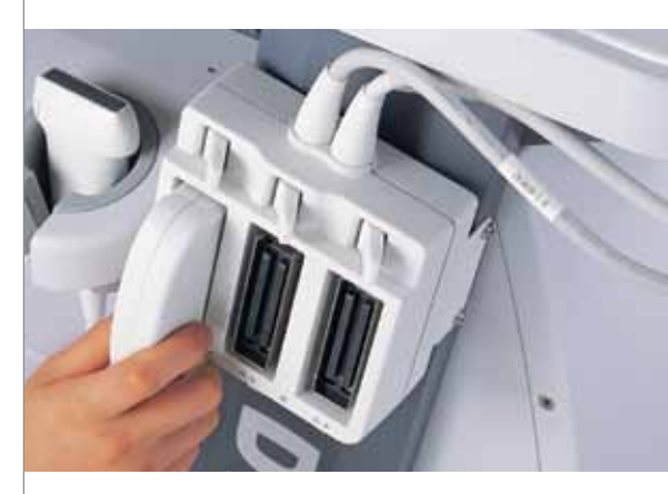
Multiple transducer connector