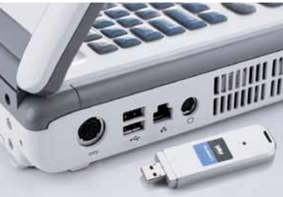
iRoam: wireless data transfer